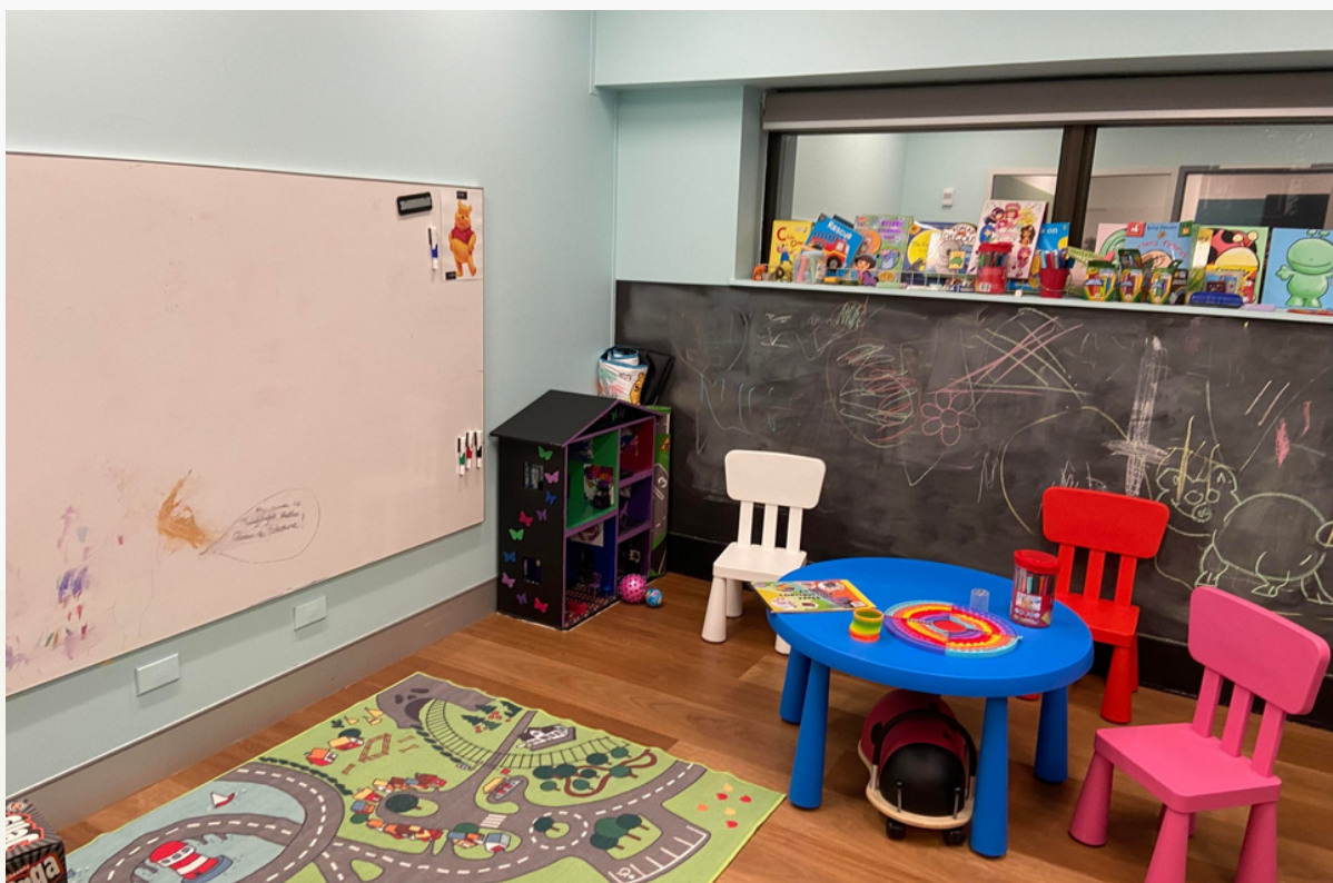
Private waiting room for victim-survivors before their police interview with SACAT.