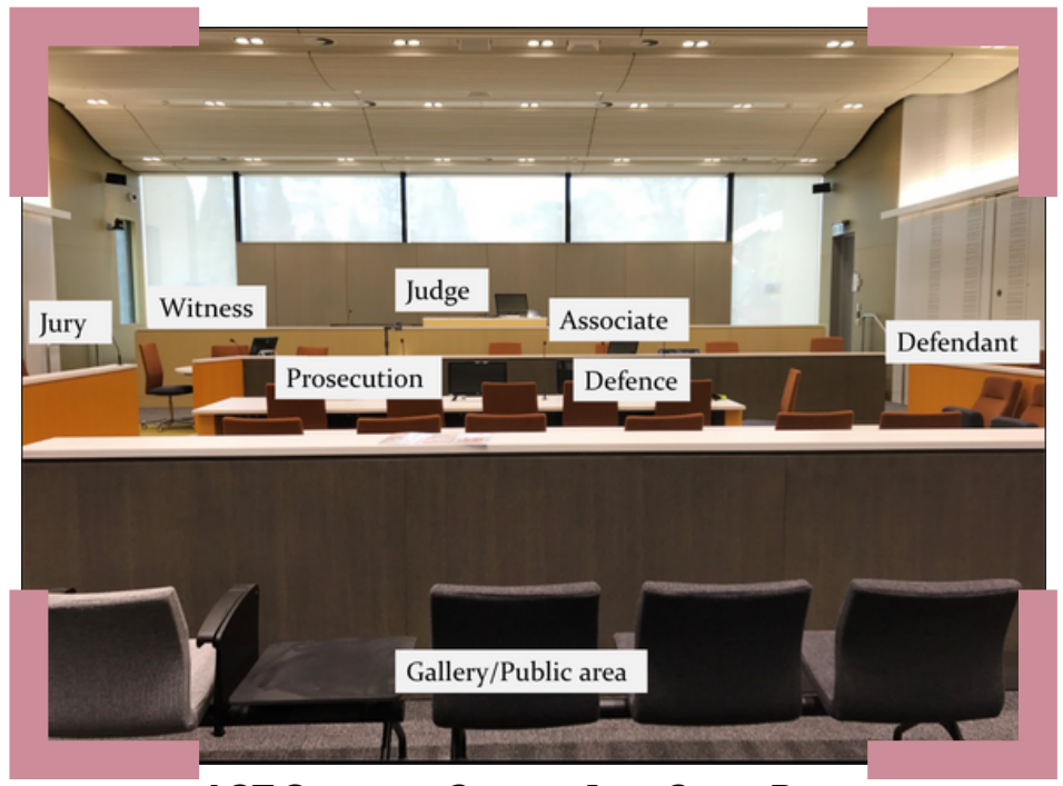
ACT Supreme Court - Jury Court Room

It may take years for a trial to begin in court after the incident was first reported to police. There is no standard length of time from initial police report to the beginning of court proceedings. There will likely be frequent delays which also lengthen the criminal justice process. However, if the victim-survivor is deemed to be a 'vulnerable adult', they may be able to give evidence at a pre-trial hearing so their involvement in the trial process can be finalised earlier. Due to this lengthy process, there is potential for re-traumatisation and further harm to occur. The criminal justice process may not be the right avenue for many individuals. It is important for victim-survivors to seek legal advice and professional support for more information about the criminal justice process.